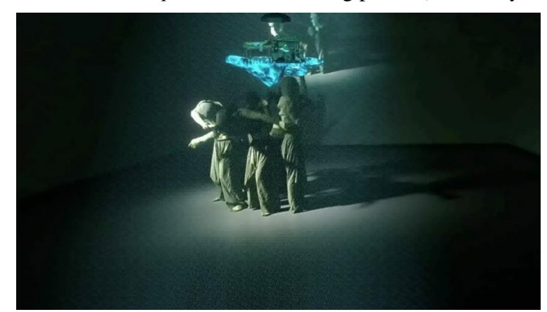
Figure 8. A scene of Deep Weather – The Last Home of Humankind (created by the author)