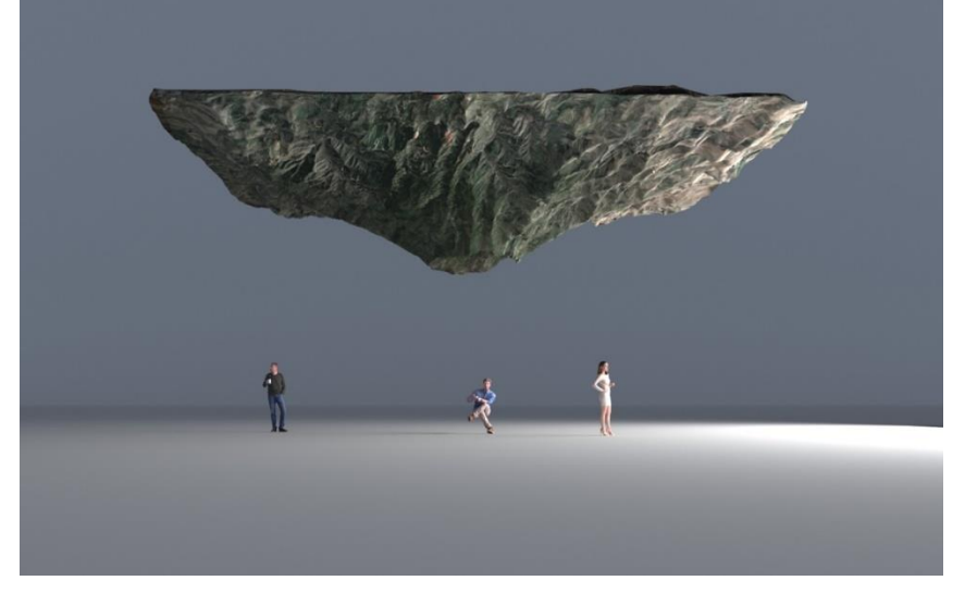
Figure 2. Low-precision model of Deep Weather (created by the author)

Of course, low-precision 3D models that are close to the real effect can also be achieved by rendering baking maps. The principle of baking maps is to store the visual information of the surface on the map. These visual cues encompass surface color, texture, transparency, reflection and refraction. It is these attributes that give the three-dimensional virtual world similar color and lighting information to the real world. This is our baking maps for rendering. After importing Unity, the visual effect is much better than that of ordinary game images. Of course, it is different from 3D movies. The image quality of MR can be used as a reference for mobile game images, but the current technology cannot achieve a complete real image.