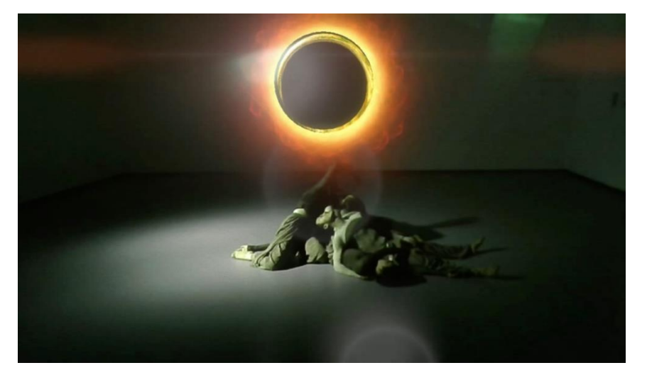
Figure 6. A scene of Deep Weather – The radiation of the sun (created by the author)