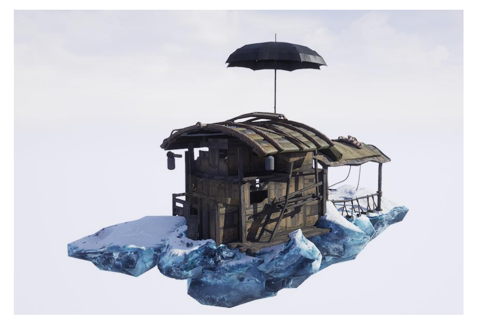
Figure 1. High-precision model of Deep Weather (created by the author)

Of course, low-precision 3D models that are close to the real effect can also be achieved by rendering baking maps. The principle of baking maps is to store the visual information of the surface on the map. These visual cues encompass surface color, texture, transparency, reflection and refraction. It is these attributes that give the three-dimensional virtual world similar color and lighting information to the real world. This is our baking maps for rendering. After importing Unity, the visual effect is much better than that of ordinary game images. Of course, it is different from 3D movies. The image quality of MR can be used as a reference for mobile game images, but the current technology cannot achieve a complete real image.