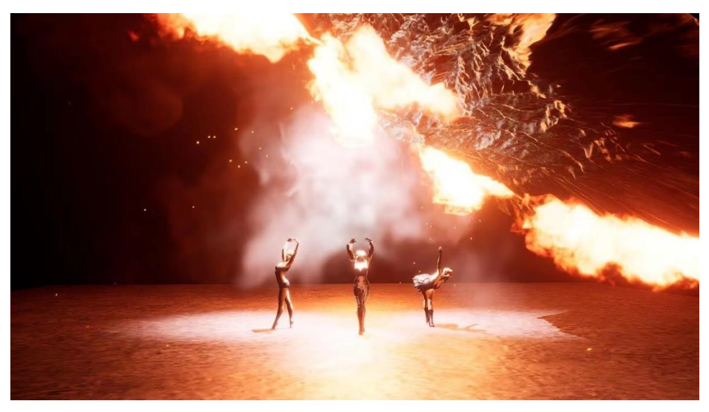
Figure 3. Unity 3D combustion effect of Deep Weather (created by the author)

In the course of the project it is also determined that the docking between 3D Max and Unity3d virtual engine should be run in in advance. If you want to express special effects, it is impossible to import Unity3d after finishing in 3D Max, because the special effects of various 3D software are not common. These effects can only be done in Unity3d. Or the special effects can be created in other software, rendered as two-dimensional Gif animation and imported into Unity3d. But this means that the scene is a two-dimensional animation. If the audience's perspective changes, the sense of space achieved by the 3D scene cannot be achieved anymore. Therefore, if the audience's perspective is limited to a fixed dimension during the performance, one can try a two-dimensional if animation. If the perspective changes a lot, you still need Unity3d to produce special effects. Of course, there are not many special effects in the scene. The main reason is that the performance of the mobile terminal is breaks down (there will be jams and flashbacks).