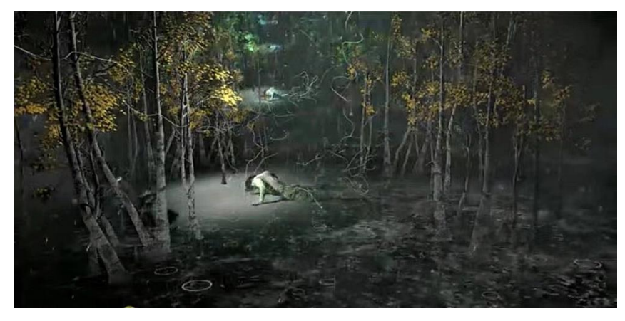
Figure 5. A scene of Deep Weather – Dance in the forest (created by the author)

The MR stage is a new technology used to replace traditional stage sets, creating a virtual three-dimensional space in which actors perform on stage while the audience perceives them as being within a virtual environment. This innovation expands the spatial possibilities of stage performance and enriches the expressive power of stage art. Taking Deep Weather as an example, through MR technology, this production successfully created a three-dimensional virtual space on the theater stage (fig. 5-8). The virtual space was also projected onto the walls of the theater, allowing audience members who cannot use mobile devices to immerse themselves in the atmosphere of global ecological change, and providing a strong sense of presence at the scene for all viewers.