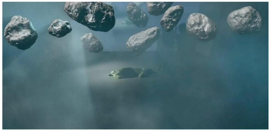
Figure 7 . A scene of Deep Weather – Floating planet (created by the author)